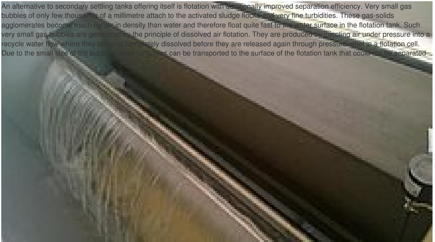
Clear flow without turbidities

An alternative to secondary settling tanks offering itself is flotation with additionally improved separation efficiency. Very small gas bubbles of only few thousands of a millimetre attach to the activated sludge flocks and very fine turbidities. These gas-solids agglomerates become much lighter in density than water and therefore float quite fast to the water surface in the flotation tank. Such very small gas bubbles are generated by the principle of dissolved air flotation. They are produced by injecting air under pressure into a recycle water flow where they become completely dissolved before they are released again through pressure relief in a flotation cell. Due to the small size of the bubbles, even turbidities can be transported to the surface of the flotation tank that could not be separated